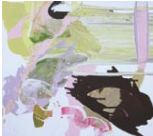
PHILIPPA BLAIR, Blush No 1 Oil on canvas, 60 x 60cm, 2004