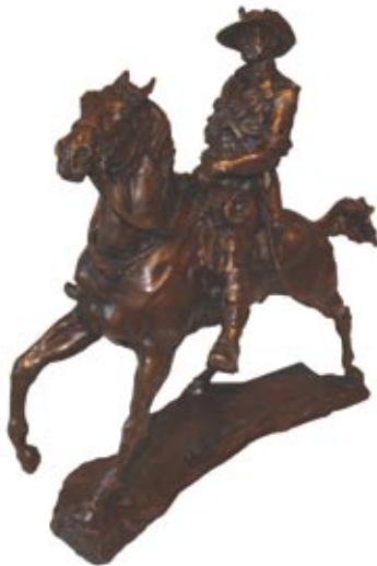
ALAN SOMERVILLE, Mounted Rifles Bronze Sculpture Ed 14