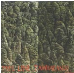
MARK WOOLLER, Tawharanui Tree Line Oil on canvas, 40 x 40 cm, 2010