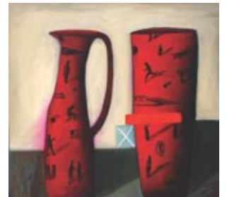
ROBYN GIBSON, Strangely Normal Oil on canvas, 60 x 60cm, 2010