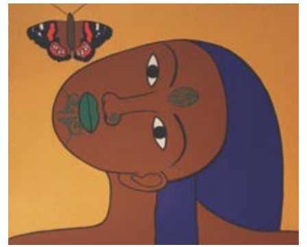
ROBYN KAHUKIWA, Kahukura Screenprint on Fabriano Artistic paper, Ed. of 30, 44.5 x 59 cm