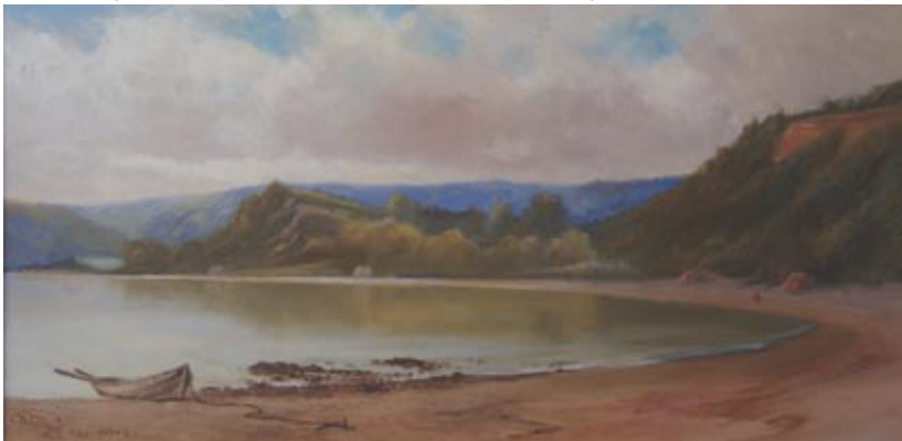
C.W. FOSTER, Orua Bay, Awhitu Peninsula , Oil on board, 43x84cm, 1906