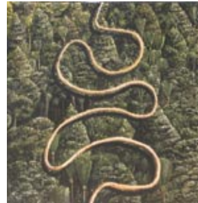
MARK WOOLLER, Forest River Oil on canvas, 40 x 40 cm, 2010