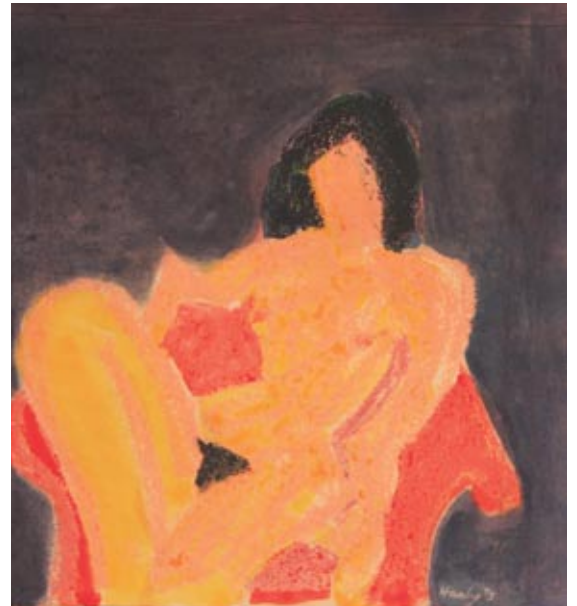
PAT HANLY, Torso Series - Girl in a chair Watercolour and mixed media on paper, 22 x 20cm, 1975