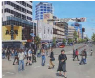
TYRONE LAYNE, Pre-Labour Day Oil on card, 48.5 x 39.5 cm, 2010