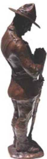
ALAN SOMERVILLE, Kiwi Soldier Bronze Sculpture Ed 50, 30cm high, 2008