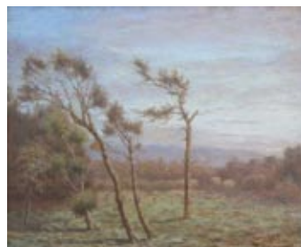
AE ALDIS, Farm near Auckland Oil on board, 24x29.5cm, c1890