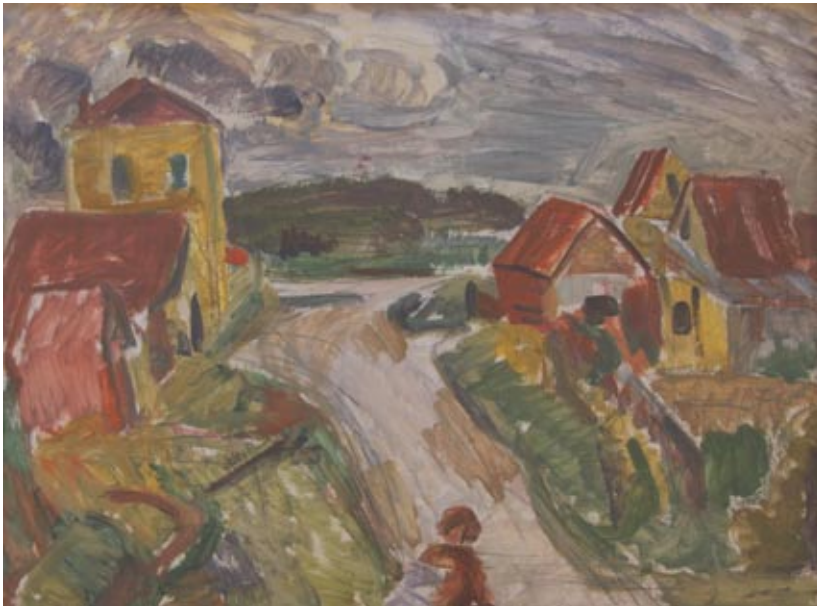
TOSS WOOLLASTON, Westcoast Landscape Oil on card, 42.5 x 56.5cm, c.1950

W. www.warwickhenderson.co.nz | E. info@warwickhenderson.co.nz