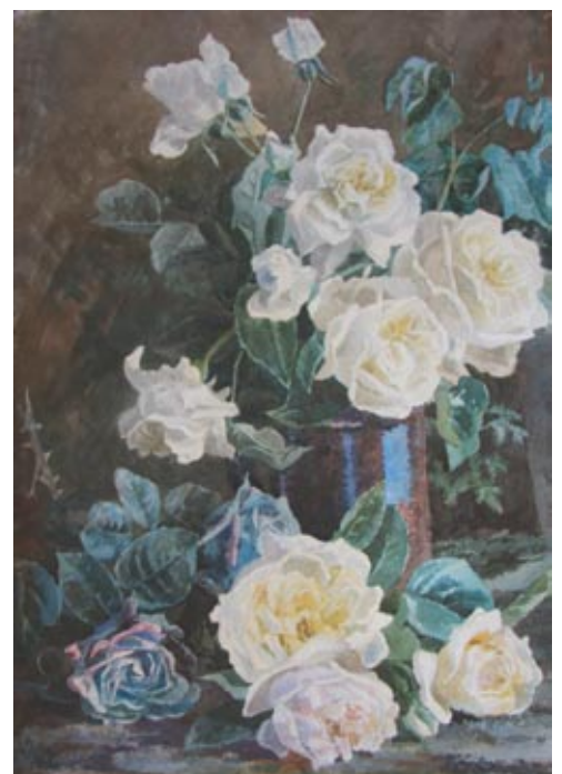
MARGARET STODDART, White Roses , Watercolour on paper, 49 x 32.5cm, 1890