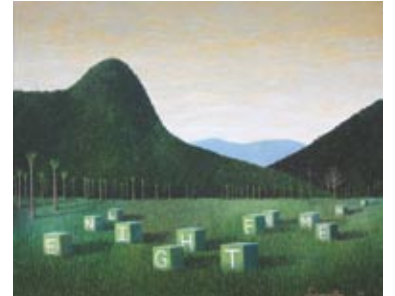
JUSTIN SUMMERTON, Enlightenment Oil on canvas, 46 x 56 cm, 2009