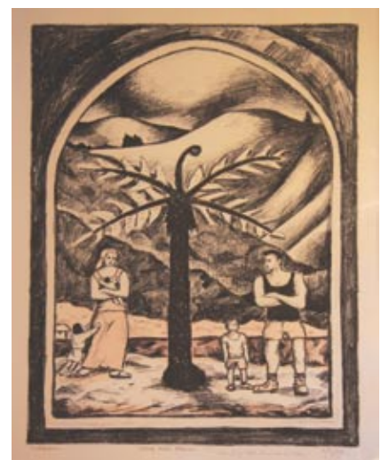
NIGEL BROWN, Land and Family Hand coloured lithograph 28/30, 57 x 41cm, 1979