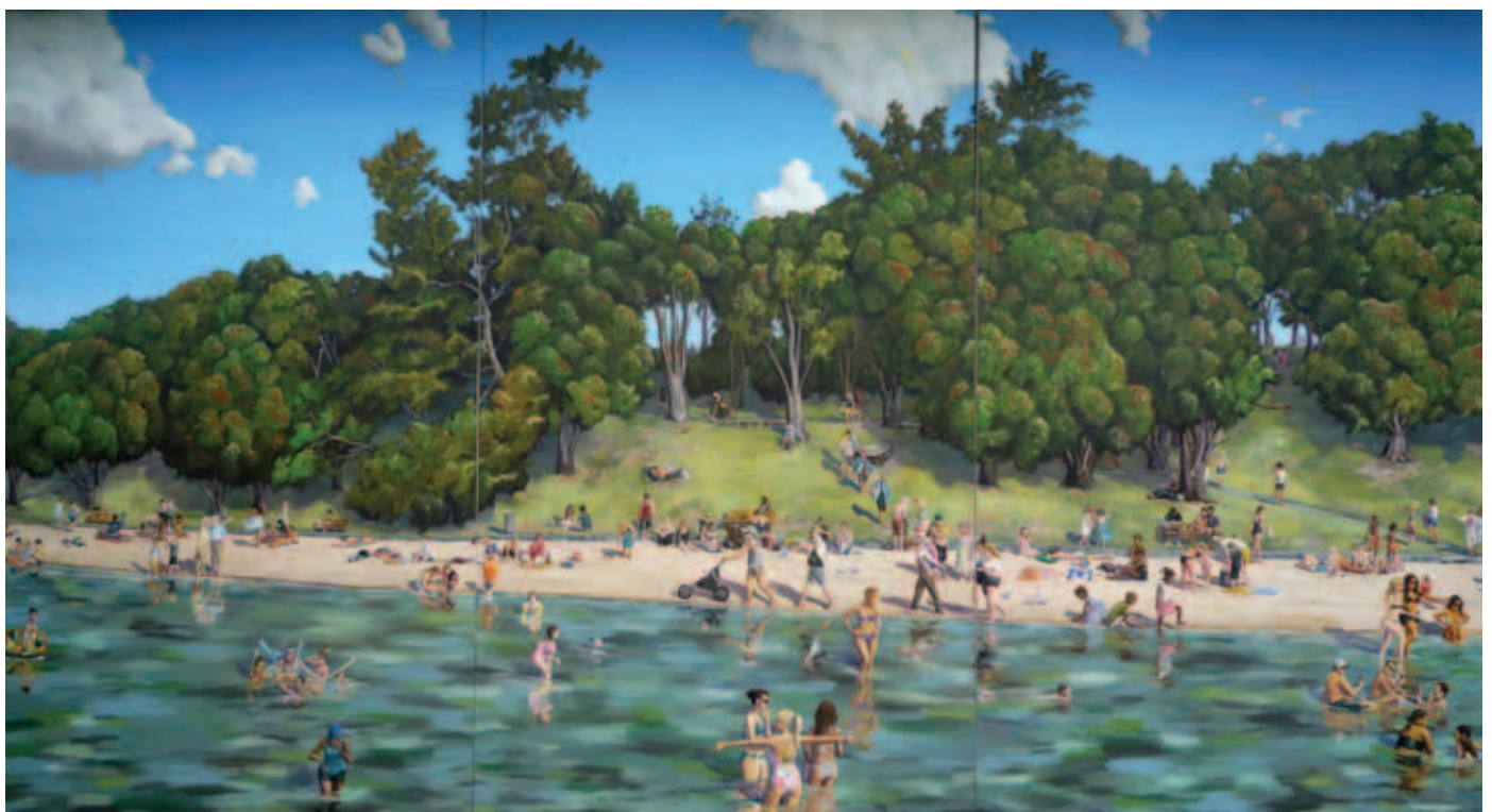
Tyrone Layne, Point Chevalier IV, Oil on canvas, 210 x 390cm (3 panels)