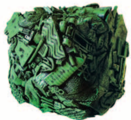
Alexander Bartleet, Green Rough Block , 20 x 20 x 20cm