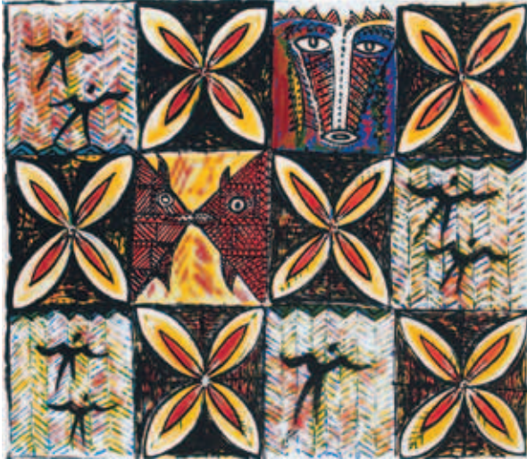
Fatu Feu'u, Matu Atua , Art print edition of 45 (unframed), 87 x 75cm (image size)