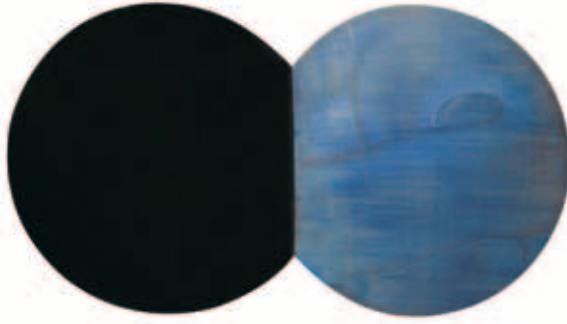
Nick Wall, Dick's Denim , Gesso, caprithane on wood panel, 41 x 74cm