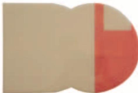
Nick Wall, Cool School LA , Gesso, acrylic and synthetic polymers, 20 x 30cm