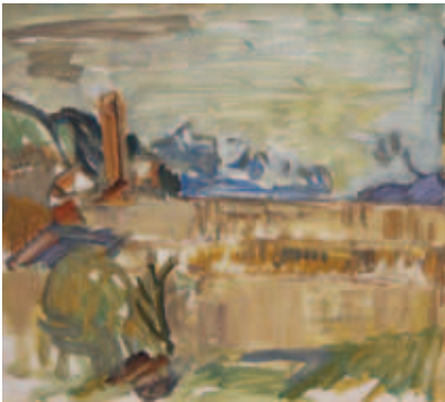
Sir Toss Woollaston, Greymouth , Oil on board, c1950, 46 x 52cm