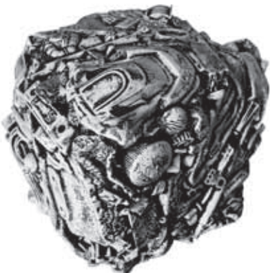
Alexander Bartleet, White Rough Block , 20 x 20 x 20cm