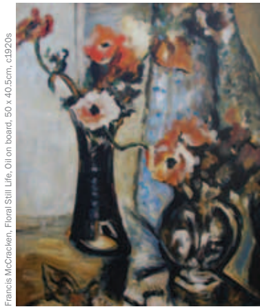
Francis McCracken, Floral Still Life, Oil on board, 50 x 40.5cm, c.1920s

We take pleasure in presenting our Summer Catalogue for 2011/2012. Our exhibition includes a wide range of artwork once again, with works from three centuries of New Zealand Art. We open with a fine 19th century painting of Lake Waikaremoana dated 1896 by A E Aldis – which