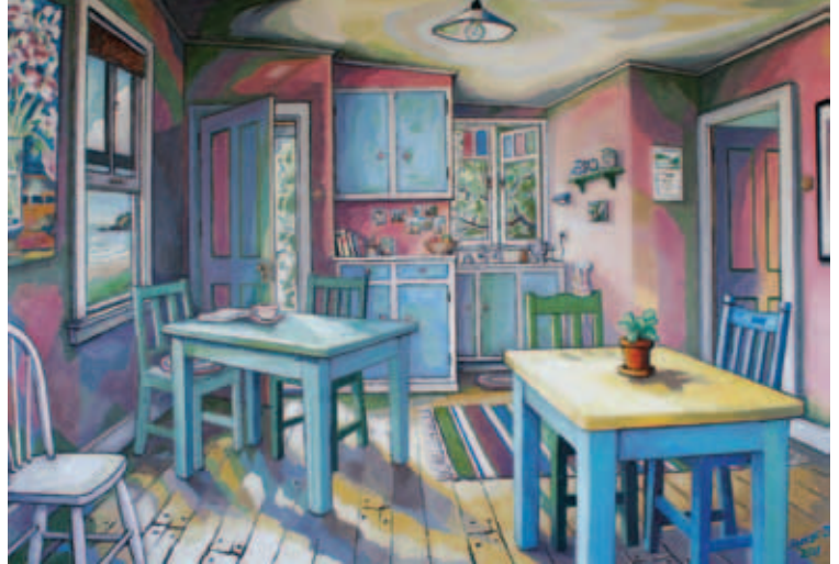
Raymond Jennings, Northland Bach Interior , Oil on canvas, 89 x 130cm