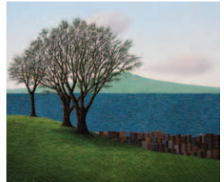
Justin Summerton, Rangitoto from the Whau Tree , Oil on canvas, 91 x 101cm