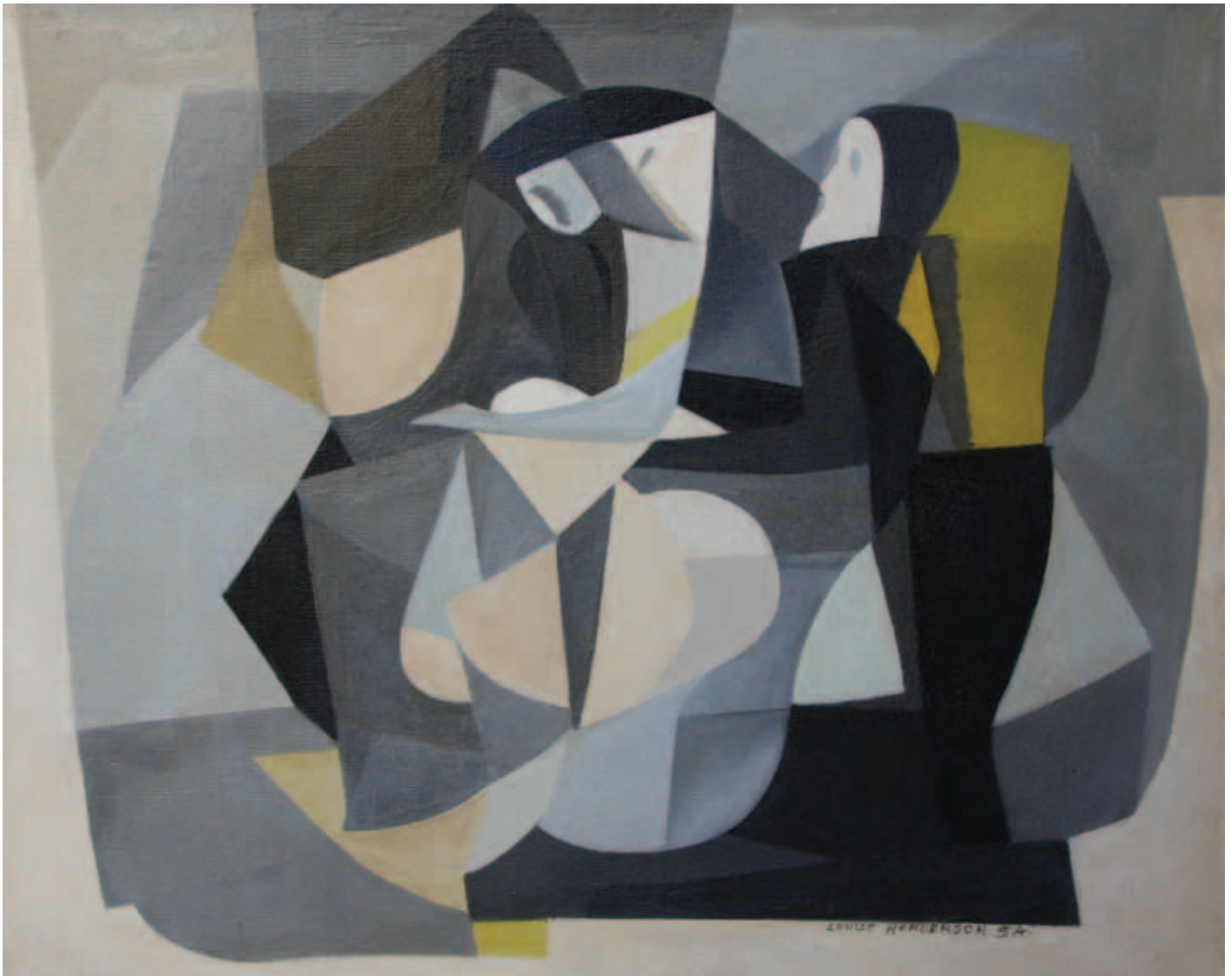
Louise Henderson, Cubist Woman Composition , Oil on board, 82.5 x 100cm