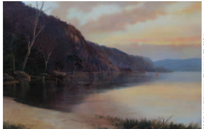
A E Aldis, Lake Waikaremoana, Oil on canvas, 30 x 44.5cm

The whole catalogue is also on-line and further works will be added to the catalogue as they arrive.