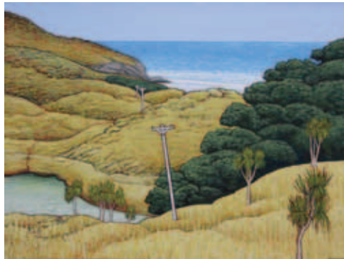
Don Binney, Pole Line Te Henga , Oil on board, 2000, 56.5 x 75cm