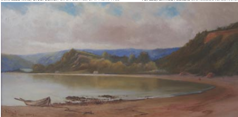
C.W. FOSTER, Orua Bay, Awhitu Peninsula , Oil on board, 43x84cm, 1906