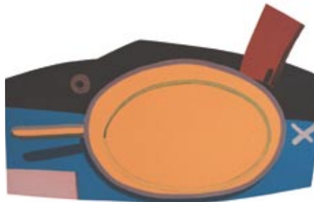
EION STEVENS, Poached Duck Oil on shaped board, 38 x 62 cm, 2009