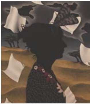
VIKY GARDEN, Self Portrait in a Landscape Oil/acrylic on canvas, 65.5 x 55.5cm, 2010