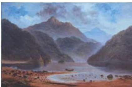
INITIALLED MHB, Great Barrier , Oil on canvas, 29 x 44cm, 1908