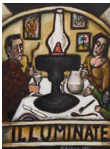
Illuminate, 2007 Acrylic on board, 600 x 800mm

Preview 14th October - 15th October - 8th November 08