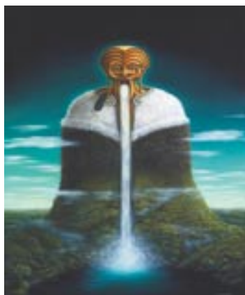
Liam Barr Tane 2008 Oil on linen 1010 x 840mm