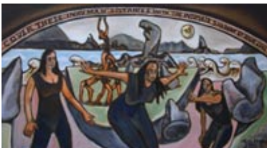
Cover these Inhuman Distances

We have once again been selected to exhibit at the 2009 Auckland Art Fair and have booked a double size stand. This show takes place in May next year and promises to be the best fair so far.