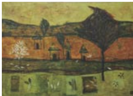
Houses in the Valley, Browns Bay, 2008, 600 x 800mm

Preview 30th September - 1st - 11th October 08