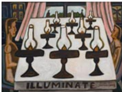
Lamp Table, 2007-2008 Oil on canvas, 600 x 800mm

Nigel Brown has a fine show in October based on McCahons Lamp used in his paintings in the early 1950's. The majority of these paintings are sized around 800 x 600mm and priced between $7,500 and $8,500. Images of these works are available and we will be pre-selling this show. Contact the gallery early if you are interested.