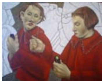
Viky Garden New World Virtues III 2008 Oil/acrylic jute, 800 x 1200mm